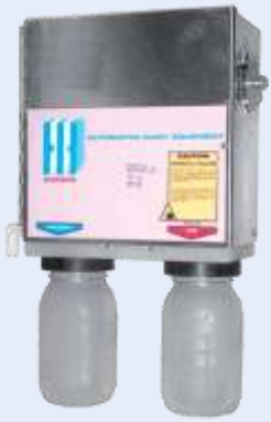
Model 3 TanK Washer