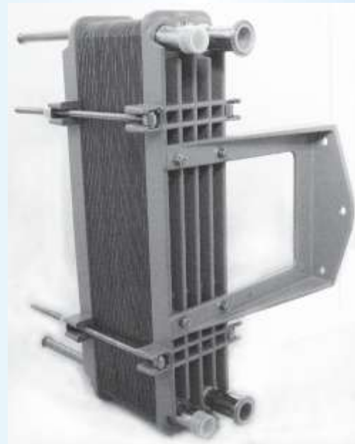
Plate Cooler Parts

20961 - Inlet/outlet gasket for M-Series plate cooler